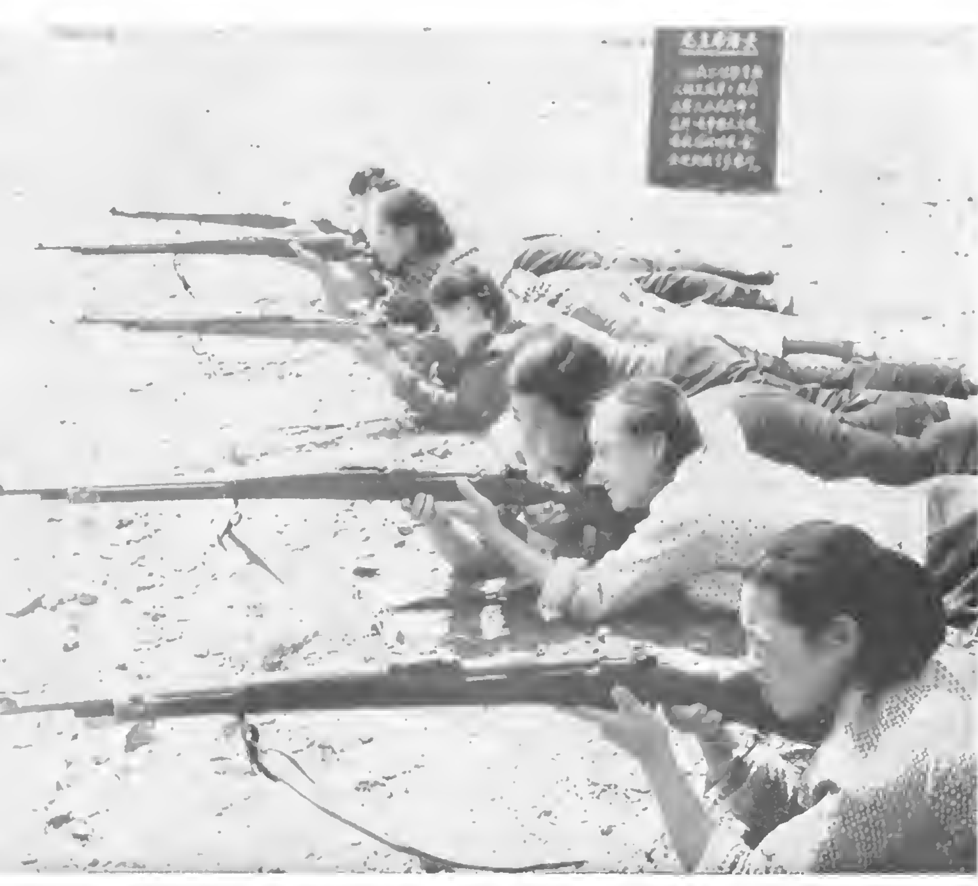
The farm's militia at target practice.

ed to Frog Pond. They filled in the sunken places with the stones which they dug up. They used hammers, crowbars and picks to remove huge stones and tree stumps weighing as much as 100 jin . As time went on the blisters on their hands became calluses.